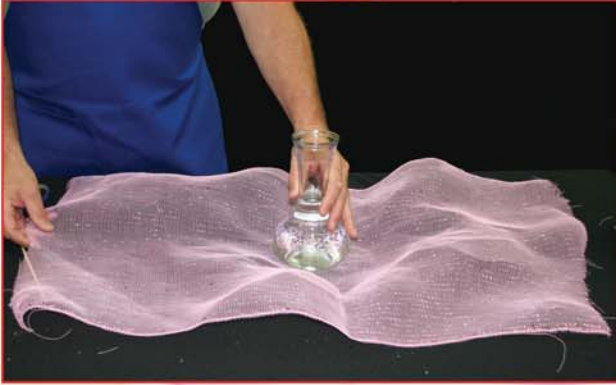
Step 1: Take a bulb vase & 2 yards of deco mesh