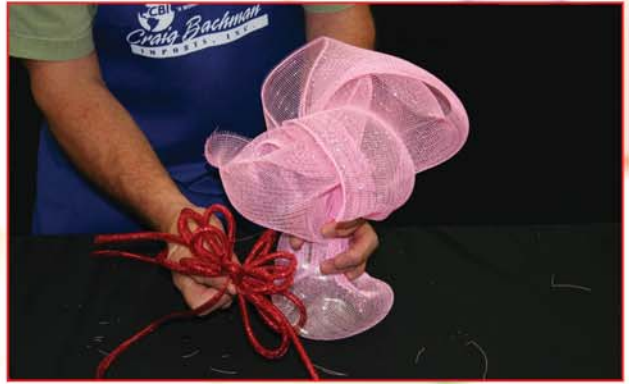
Step 4: Take pre-made deco flex tubing bow and wrap around bulb vase (to hold deco mesh in place)