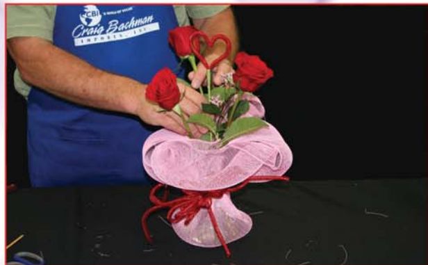
Step 5: Add heart pick, fresh flowers and leaves for added decoration