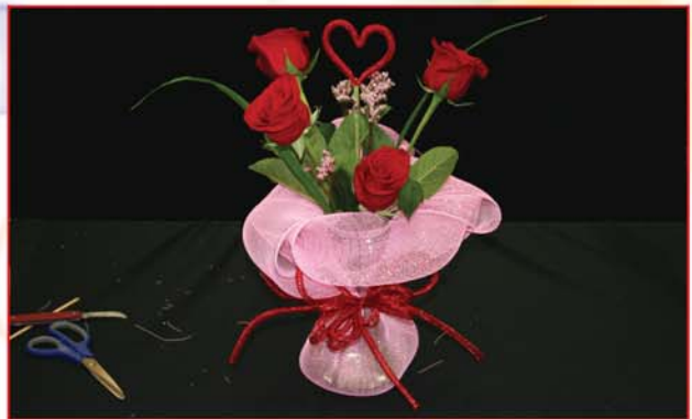
Step 6: Finished Product